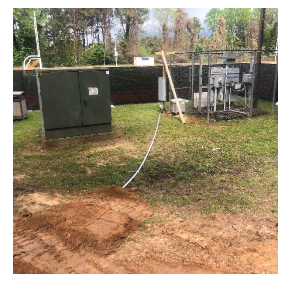
Temporary Power Installed