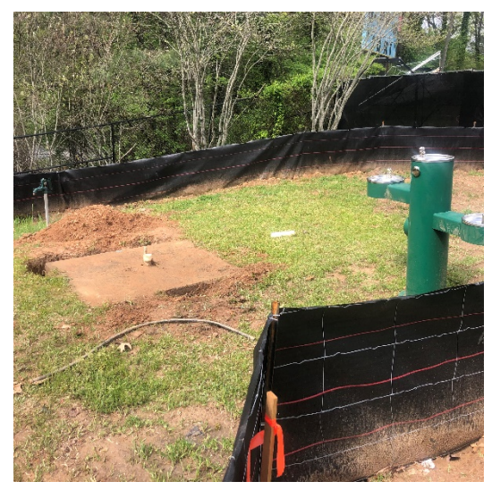
Water Fountain Removal