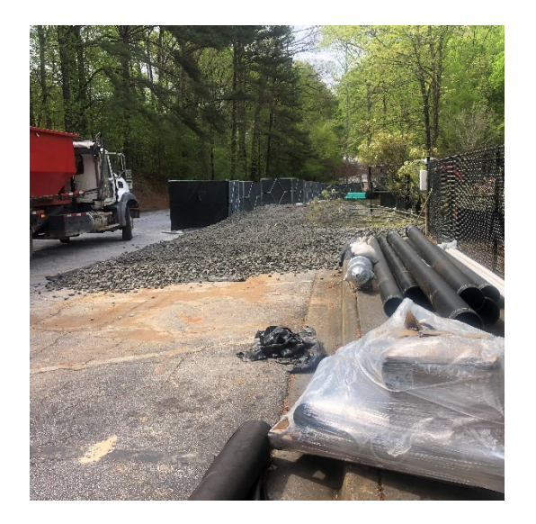
Site Access Road and Material Laydown